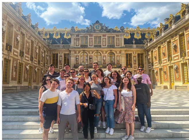
Smith Scholars on a trip to France and Belgium in May 2022.

The Stephen S. Smith Center in the Williams College of Business at Xavier University is one of the outstanding academic programs in ACTA's Oases of Excellence network. The Smith Center "promotes learning, scholarship, and debate about fundamental questions and ideas that impact society." At the core of the center is the Smith Scholars Program. This undergraduate, cohort honors program "provides a challenging and comprehensive learning opportunity for students who want to pursue a business major that is enriched by an in-depth study of the liberal arts." Smith Scholars complete a minor in political economy built on a foundation of texts in philosophy, history, and economics. The minor includes a study abroad grant. Smith Scholars also edit and publish Publius , a quarterly magazine.